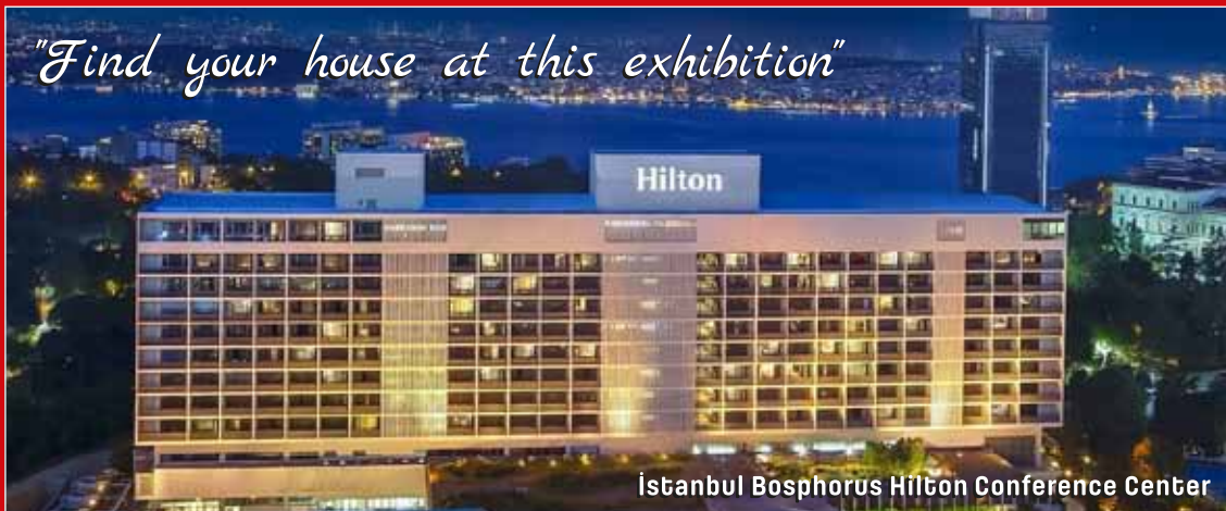
Istanbul Bosphorus Hilton Conference Center