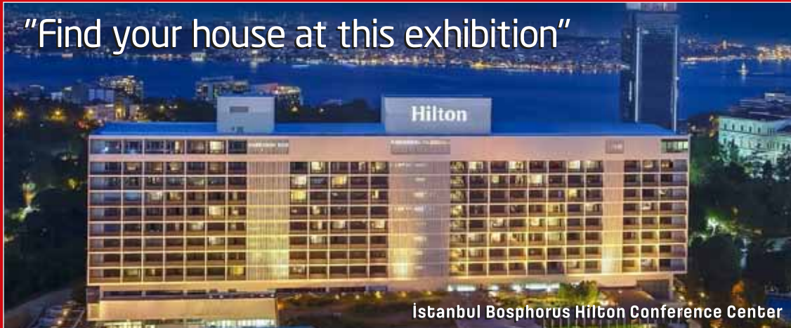
Istanbul Bosphorus Hilton Conference Center